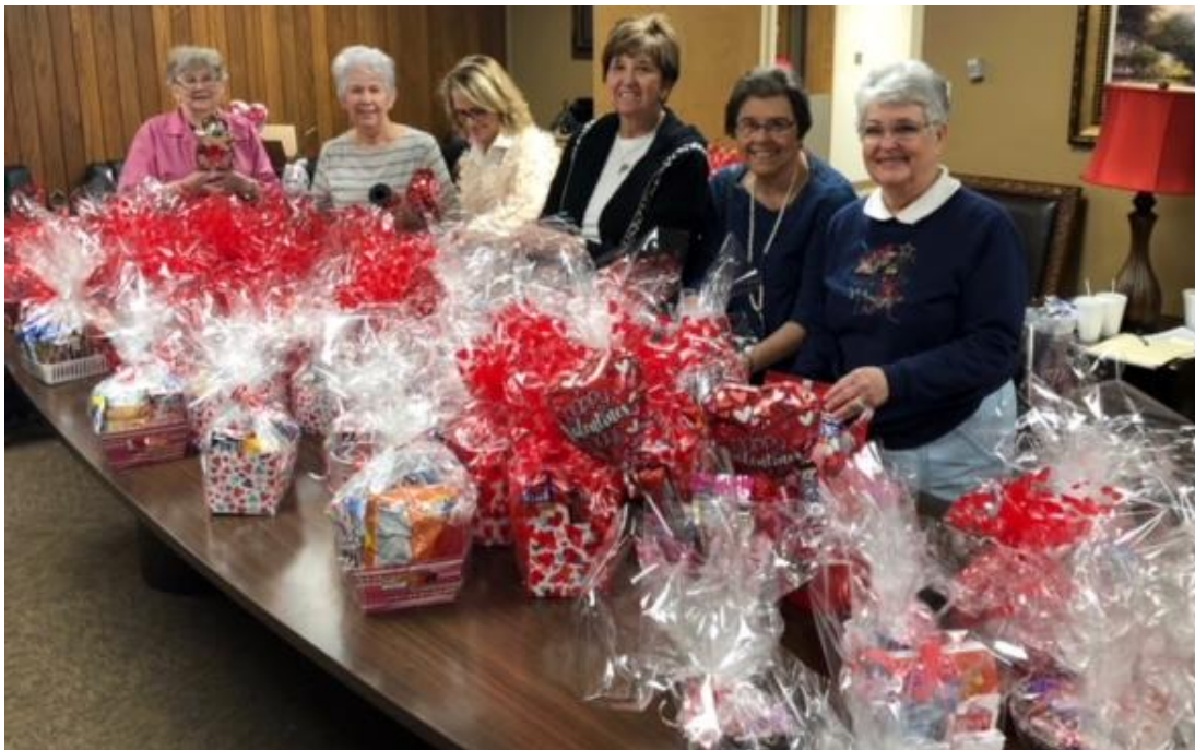
Drew Memorial Hospital Auxiliary Members made Baskets, Tubs and Cups for Valentine's Day.