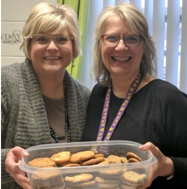
Berryville High School

The scholarship committee was privileged to visit with counselors at three local high schools promoting availability of scholarships and our Jr. Auxiliary program.