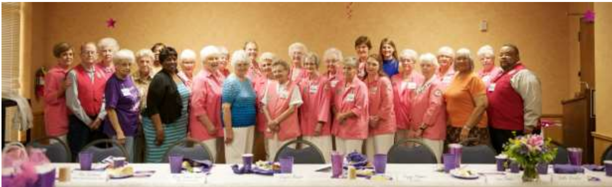
MCSA Auxiliary Annual Meeting and Installation of Officers 2016