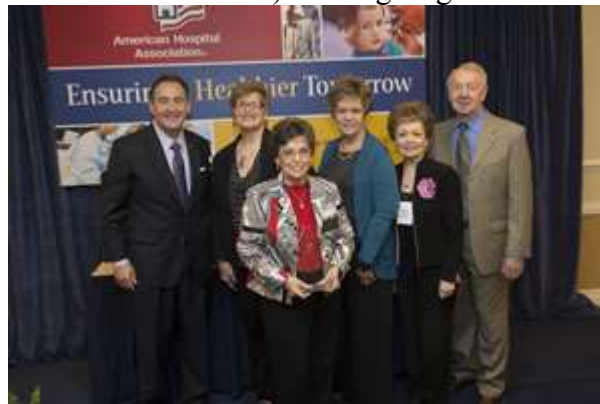
Arkansas HAVE Award Winners in 2014

What an exciting time for COV members. HAVE Award nominations are being submitted and we are all anxious to read about the programs around the country. Soon we will be judging to see who the winners are for 2016. I am so hopeful that a HAVE AWARD winner will be from Arkansas. Below is a picture of Arkansas winner (NW Medical Center-Bentonville) to bring us good luck. Let’s do it again!