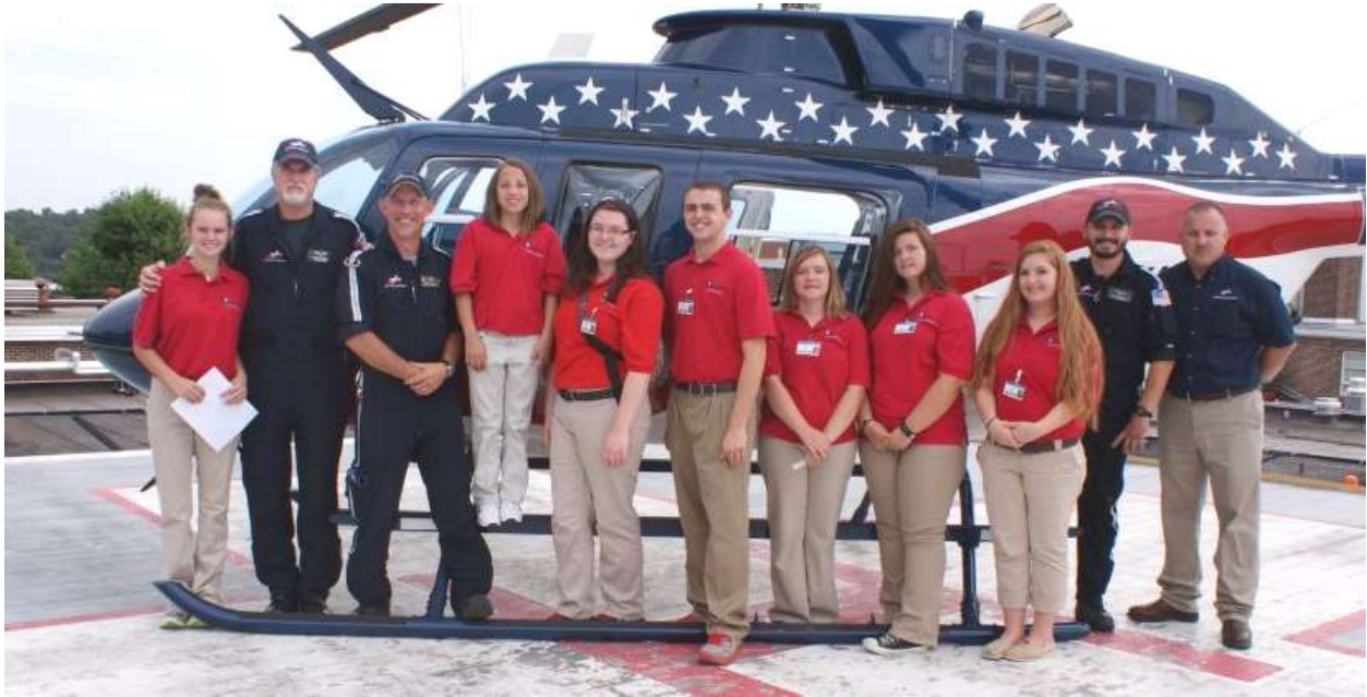
Junior Volunteers served over 800 hours during the month of July at North Arkansas Regional Medical Center.

We had 9 bright young Junior Volunteers during the month of July. They each completed hospital orientation, CPR and First Aid classes and assisted in our Thrift Store.