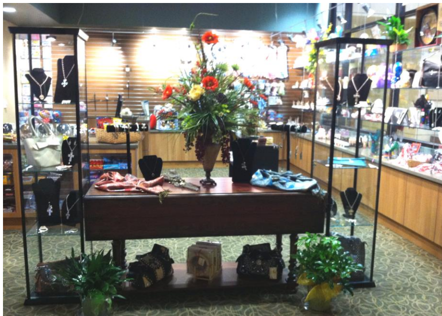
Our beautiful new gift shop.

Please drop by for a cup of coffee and a visit at our new facility if you are in the area, we would love to see you! Hope you have a fabulous year too!