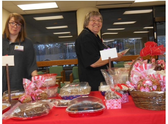
Valentines handed out to third-floor patients were a nice surprise!