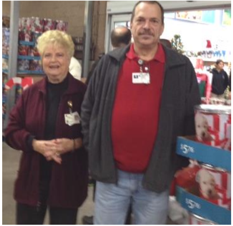
NMC Springdale donated $5,000 dollars to the Shop with a Cop program.